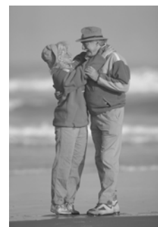
"People Helping People"